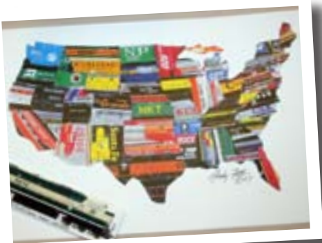
Andy Fletcher railroad U.S. map and BNSF drawing for the SD70MAC. Fletcher's drawing served as the example paint scheme for all BNSF's SD70MACs until the company colors were changed to orange and black.

See www.customtrains.org or e-mail Fletcher at andyfletcherartist@gmail.com to place an order.