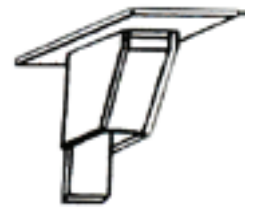
Troyer Box w/mounting system