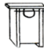
Gilwood Box w/ mounting system