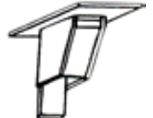
Troyer Box w/mounting system